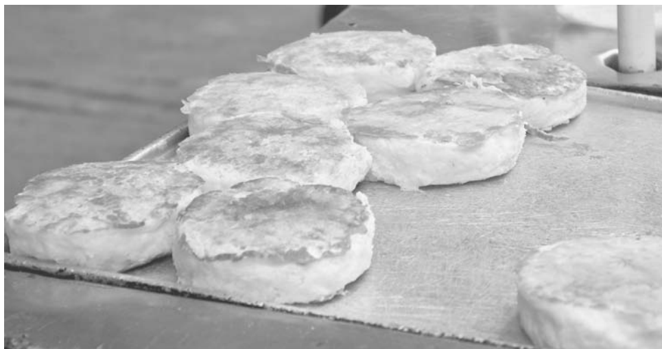
Freshly prepared grilled arepas , made with corn flour and filled with cheese.

The names arepa and Venezuela are synonymous, though they are also popular in neighboring Colombia and other Central and South American countries. Arepas are one of the national foods and reveal both the history of Venezuela’s food and its regional character. The basic arepa is a thick cake made of finely ground cornmeal, made into a dough, toasted on a griddle, then split horizontally, and filled with various ingredients. It is often griddled in butter and to be done properly should be placed in a hot oven to give it an outer crust. Another version, made in the upland areas of the country, is made with wheat flour. There are many kinds of arepas . The most popular are arepa de queso (filled with various cheeses, especially a soft